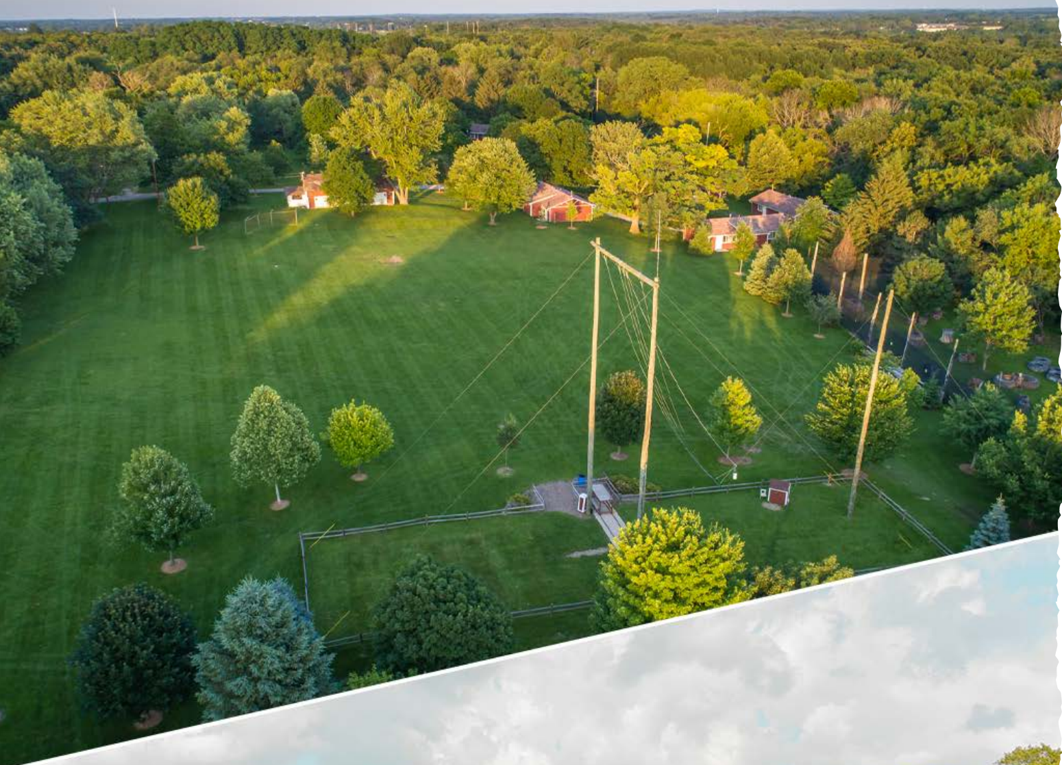
Lake Geneva Youth Camp